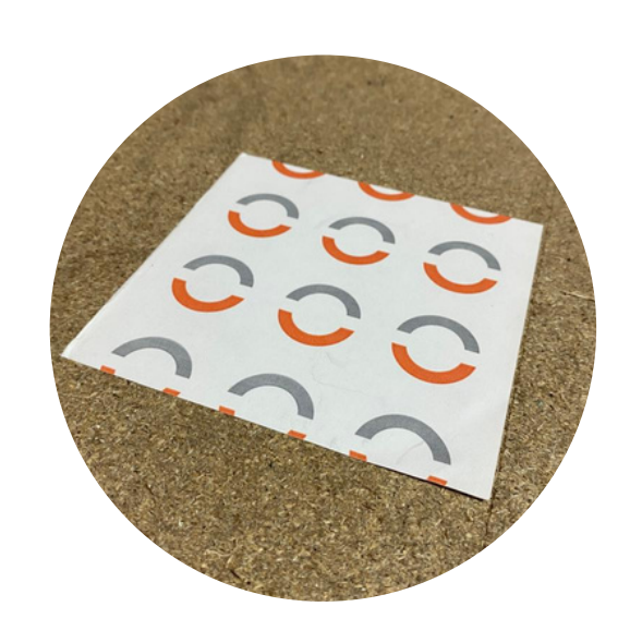
For Use in Common Built Environments Fast, clean dry-laid installation process suitable for most common sub-floors.

Eliminates messy wet trades and VOC's associated with adhesive-based methods.